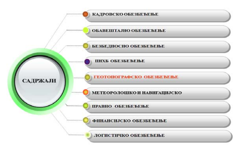
Figure 1 – The geo-topographic support in the Serbian Armed Forces support system

Therefore, according to the Operations Doctrine of the Serbian Armed Forces, "the support of forces in an operation is organized in a timely manner, continuously and completely, at all levels, in accordance with combat, weather and space conditions."<sup>2</sup>