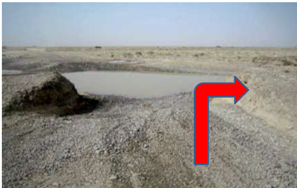
Picture 6 – Ideal place for setting up “IED” – the driver will turn right, attempting to avoid water barrier

In the past few years, especially on the territory of Iraq, attackers use specialized improvised device called Explosively Formed Penetrator – EFP . 22