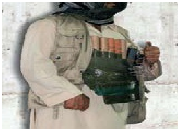
Picture 1 – Suicide-bomber who will press electrical-switch and activate explosive charge

Selection of suicide attackers from various psychological and demographic structures is observed as specificity of private security in high-risk zones.