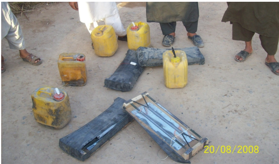
Picture 5 – Parts of improvised explosive device with initial part for stepping and explosive charge from rocket launcher gunpowder

Humans who are present at the place of explosion may be injured or killed, and vehicles which are present may be damaged or completely destroyed. After the explosion, the attackers very often act by means of light infantry weapon. Such an attack is characterized as ambush effect .